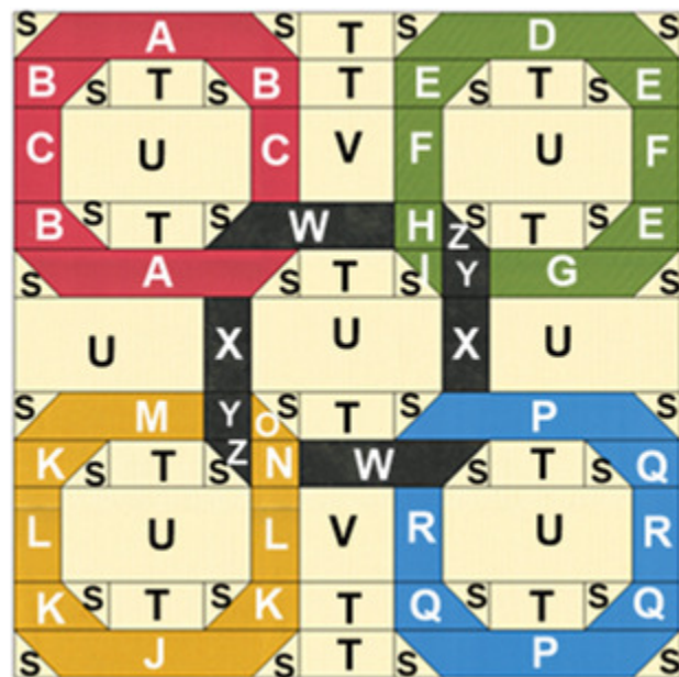
Rings – Color Chart